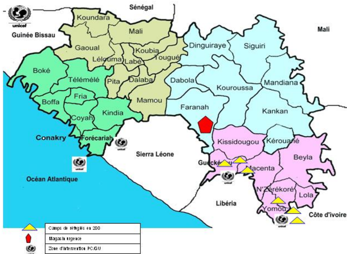
Map of Guinea

Guinea's Education for All (EFA) program was officially launched in 2002, covering a planning period of 12 years, with emphasis on three major areas of intervention: access, quality and management - as a framework for technical and financial partners' interventions. But families still bear the brunt of the heavy indirect costs of schooling. Gender and rural/urban equity in basic education remain low. Access to primary education is increasing though completion rate remains low; post-crisis areas are particularly concerned with a low enrolment rate and gender violence. Instruction is still marked by poor quality levels of teaching, planning and management (at various levels).