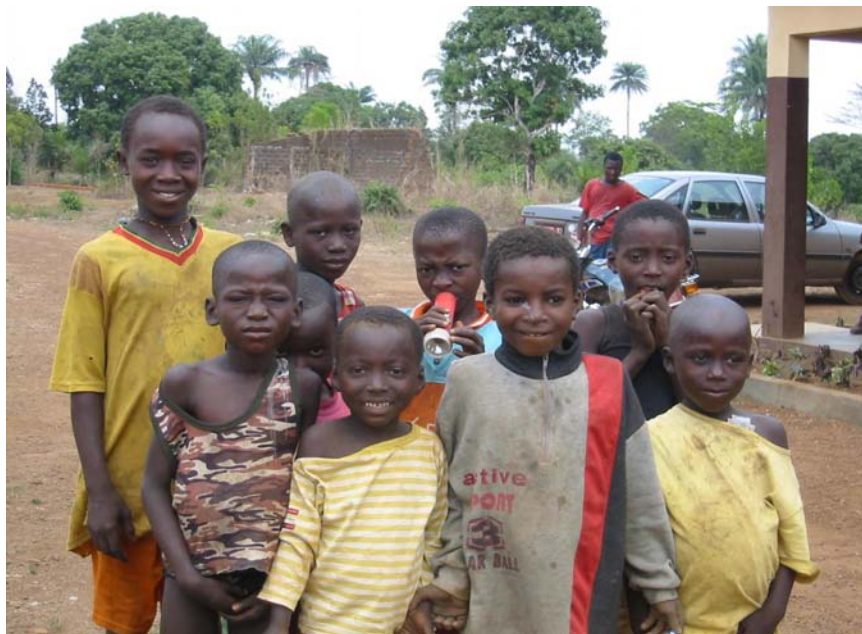
Out of school children in Forécariah standing outside a NAFA center set up by UNICEF

Other areas of intervention include: CFS; the Back to school and Go to school project; civic education; reduction of violence against girls; training of trainers; girl domestic workers; non formal education; working closely on hygiene, water, child survival and protection.